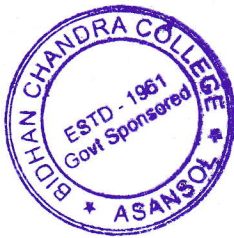
Principal Bidhan Chandra College Asansol – 4

It is hereby informed to all students of B.A/B.Sc/B.Com/ BBA/BCA/M.A to register their names in Mentor register according to the list enclosed with this notice within 10 days. Otherwise there will be problem in Internal Examination or to avail different scholarships and other facilities. Mentors are also requested to contact their mentees as per list for the smooth running of the mentoring system.