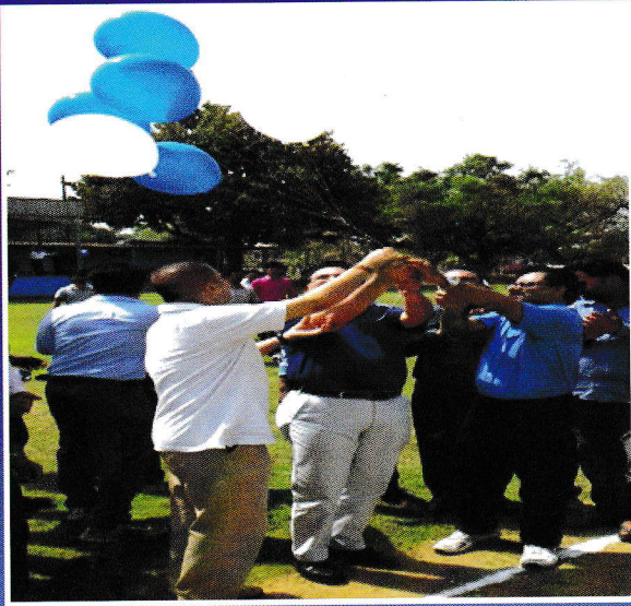
Our Honb'le President along with The Honb'le V.C. of KNU inaugurating the cricket tournament