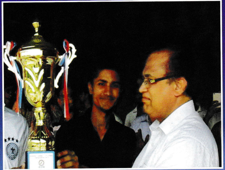
Our student taking the trophy of 2nd Inter College T 10 Cricket Championship from The Honb'le V.C. of KNU