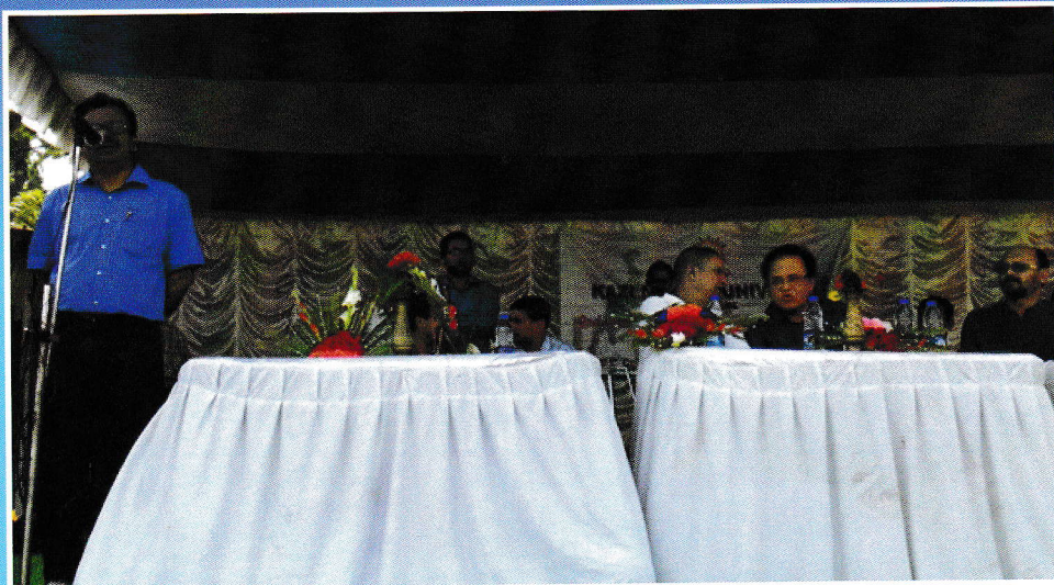
Our Principal delivering his speech at the cricket tournament