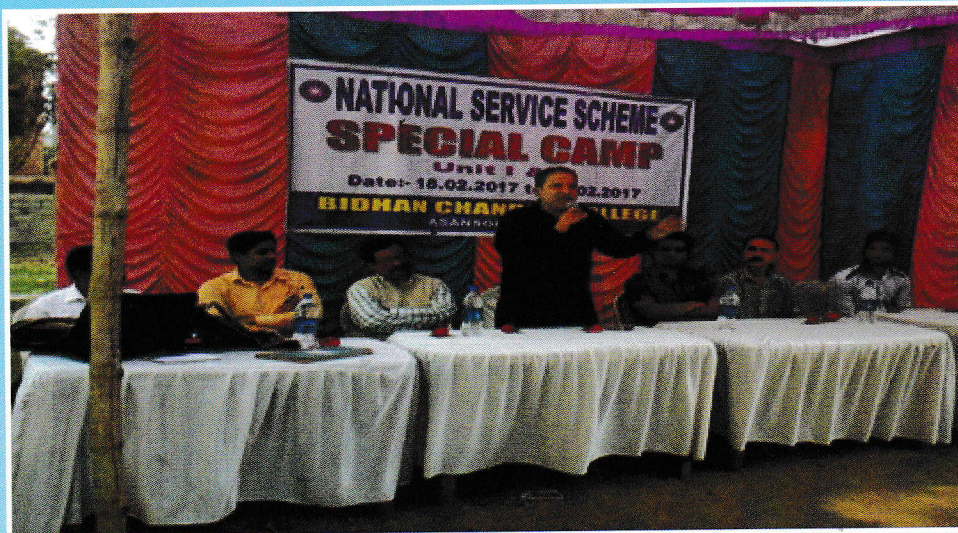
Our Honb'le President delivering his speech at the NSS Special Camp